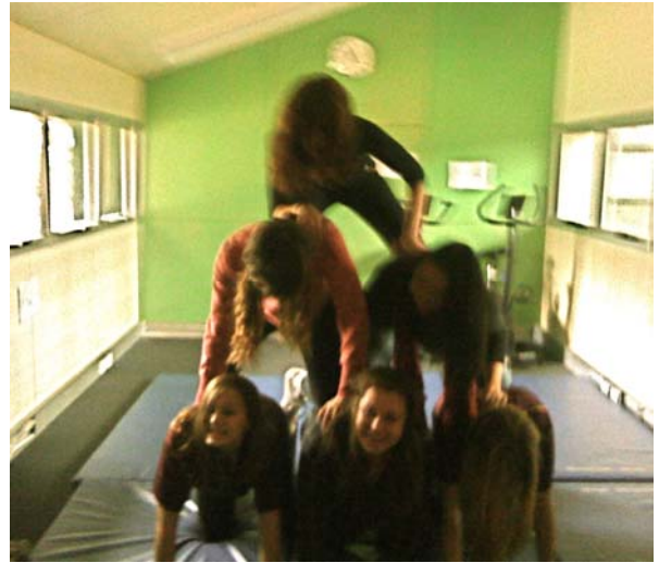
Great human pyramid during Sports Excel - Gymnastics.